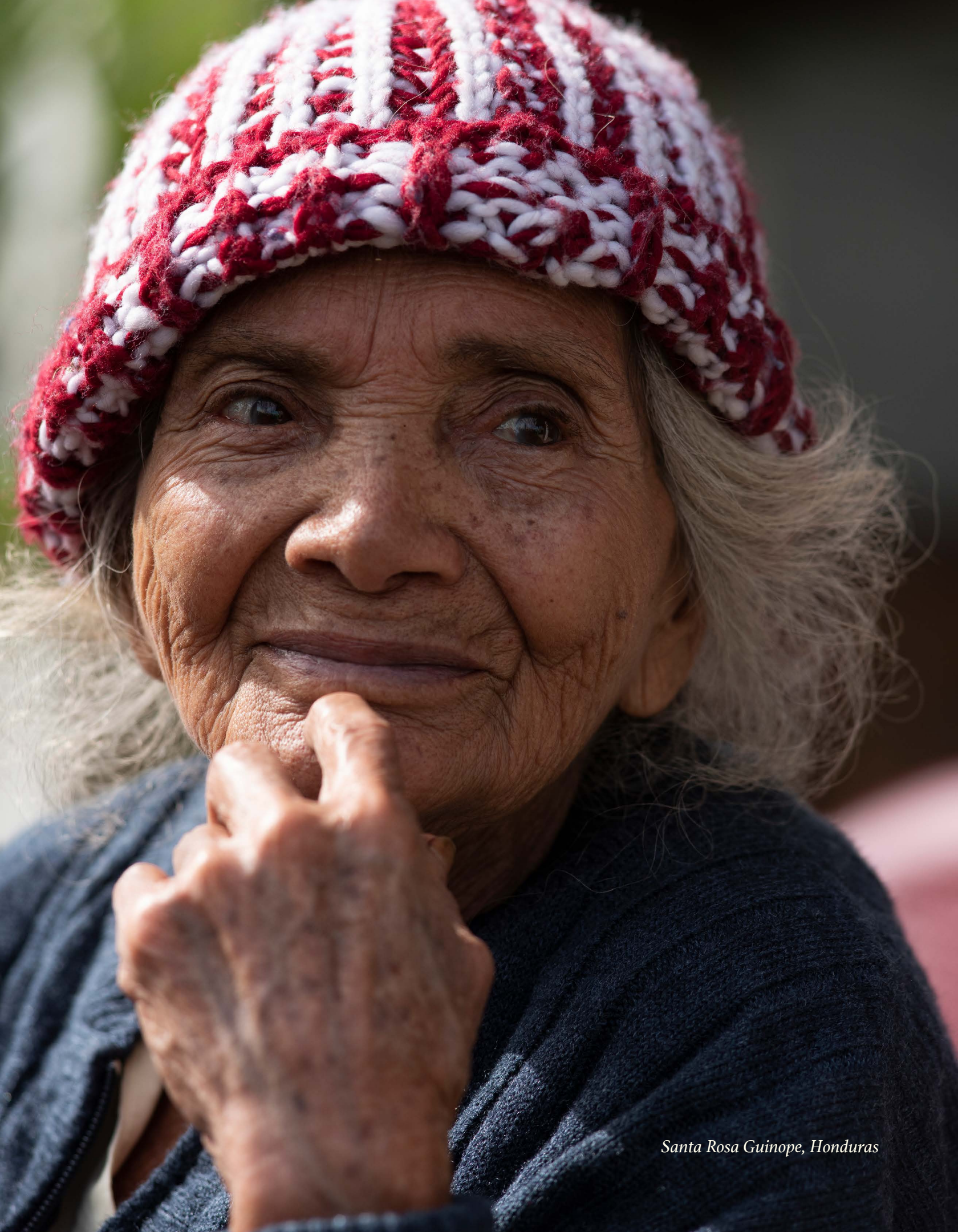
Santa Rosa Guinope, Honduras